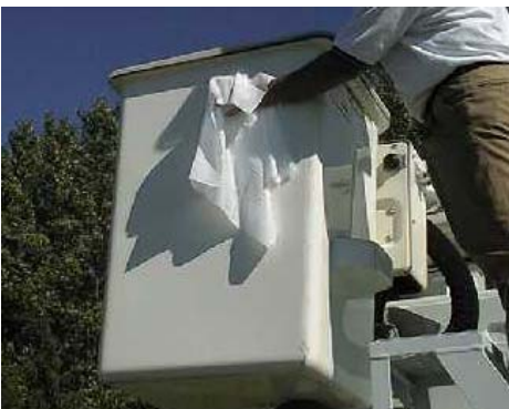
Boom Wipe cleans many types of grimes.

Boom Prewash is an effective cleaner for grease, tar, creosote, salt spray, hydraulic fluid, pine pitch and general road debris. Boom Prewash replaces acetone without the flammability. The cleaner is water soluble, and washes off during subsequent water rinsing. Boom Prewash does not adversely affect the gel coat on the boom. It is available in two convenient packages: