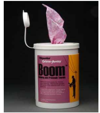
B-D72 Boom Canister contains 72 towels

Canister has pop-up convenience, and reseals for easy bench top storage. Each canister contains 72 heavy duty towels (10 X 12) with a textured side for scrubbing and removing grimes and a soft side for a finishing wipe.