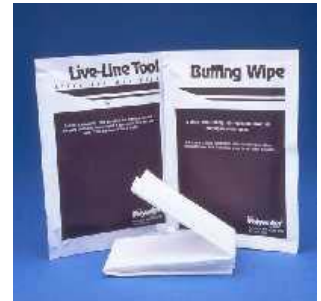
W-1 Fiberglass Wax & Buff Kit

The S-1 Wipe does not replace the occasional heavy-duty cleaning and waxing of a stick or boom. The daily wipe complements such waxing, and it's okay to wipe a waxed tool with the S-1. For easy waxing of a stick or boom, American Polywater makes the W-1 Fiberglass Wax & Buff Kit . This kit has everything ready to go. There's a lint free wipe saturated with a fast hazing, fiberglass wax plus a soft, lint-free towel for buffing the wax to a shine. The wax is easy to apply and is quickly buffed to a durable, water repellent surface. For larger jobs, the wax is also available in pints (cat # W-16).