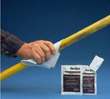
Hot Stick Wipe (S-1) Cleans and Treats

American Polywater's Hot Stick Wipe (S-1) is a true dual-purpose wipe. Besides cleaning with a fast evaporating cleaner, the S-1 Wipe also leaves a treatment on the surface that repels and beads water. A wipe with the S-1 cleans and treats at the same time, in only a few seconds. After a brief dry time, the stick is ready to use.