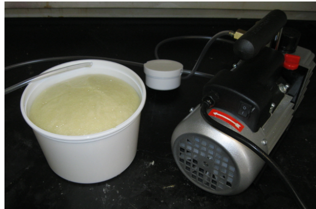
Sampling pump with hose intake near reacting foam

A filter sampling method provided by ALS Environmental, an accredited laboratory was used to collect test specimens. This is a common method of collecting aerosol (particulate) and/or vapor phase contaminants. Filter sampling uses a calibrated personal sampling pump to pull a known volume of air through a filter cassette. The filter cassette contains media chemically treated such that the MDI in the air chemically reacts with the media to form a stable derivative. The stable derivative is quantified at the ALS lab. Using the known volume of air sampled, the concentration of MDI in the air during the sampling interval is determined. This test procedure follows OSHA 47 MOD for MDI.